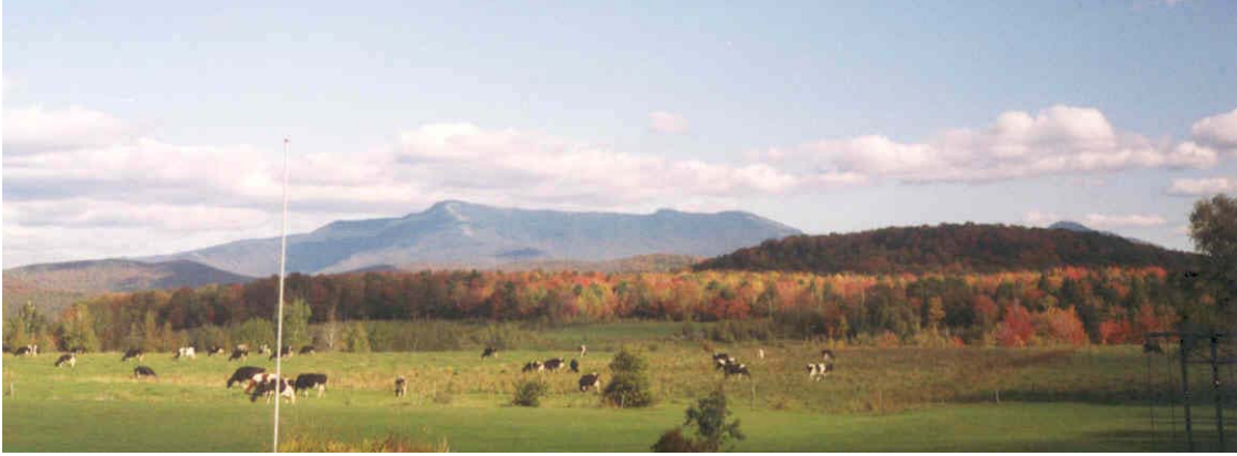
View of Mount Mansfield, VT from the house. 1992