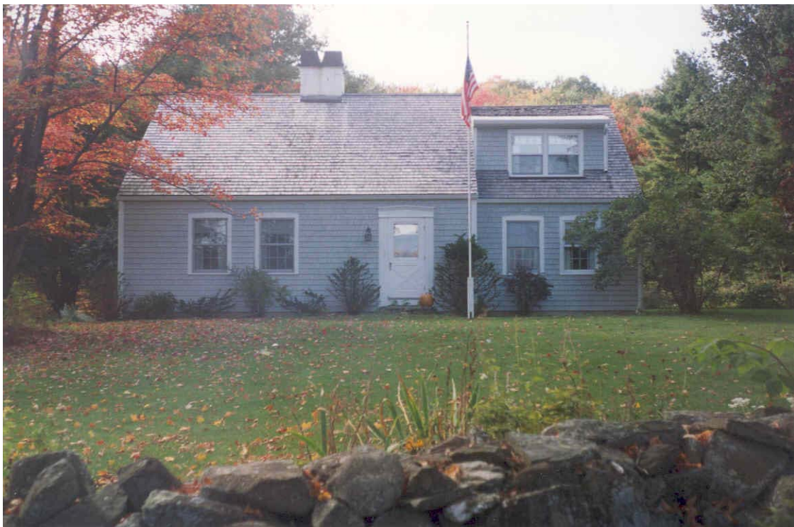
The house at Cilley Hill Rd, Jericho, VT, 1992